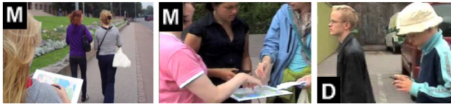
Figure 9. Walking while using and bodily configurations. Left: Girls walk in front while one tries to read off MapLens (M). Center: MapLens (M) team negotiate where next. Right: One DigiMap (D) user reads the system while the other navigates.

Seven of the eleven teams tried to use M when walking, but all faced difficulties of two kinds. First, even a very light trembling of the device makes M difficult to use. Second, the participants' possibility to be aware of their immediate environment was challenged when using M (e.g., a player walked into a lamp-post while looking at MapLens+map). Other variations were initiated. As a team of three young girls began to run out of time, one walked more slowly behind watching the device, with the others guiding her from running into anything (Figure 9 left). When she found something, she called them to look. Two other M teams persisted use while walking as they enjoyed seeing the red icons displayed on the screen as the system read and interacted with information from the environment it was passing above. For M players time spent walking was used to get from one task to another, to converse, or to discuss the last or the next task. On the whole we found M does not support 'playing by moving,' but demands effort, forethought, and planning. Indicative of this, some teams used M while waiting at traffic lights.