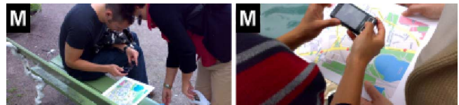
Figure 7. Stabilizing map surface for MapLens (left), then holding the device in two hands to minimise tremble (right).

M users often had to stabilise the physical map and the device to be able to focus the lens properly. They favored places where they were able to place the map on a table or a bench. They also often laid the map on the ground or held the map for their group members (See Figure 7). This was a strategy to solve the problem of hand-tremble, which some MapLens users reported also in interviews (see also [30]).