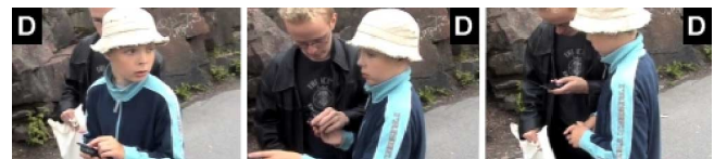
Figure 11. DigiMap (D) Users experienced difficulties while attempting to share the map as common ground.

Given that the typical way of using M involved a team gathered around gesturing on the physical map with the device, establishing common ground was easier for M groups. We noted a shared understanding around objects that are the focus of co-conversants' attention [7]. The location of M on the paper map, and the contents revealed to others on its display, helped all to understand points under discussion without explicitly needing to ask or negotiate. In Figure 10 a young woman browses the map by using M. After finding a place, she suggests it to her father by pointing to it with her finger. The father proposes a nearby location and points to it by using the corner of a clue booklet.