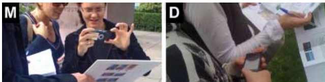
Figure 5. MapLens (M) was held in a way that it could be shared in the group, whereas DigiMap (D) users held the device more privately.

By contrast, D users typically kept the device lower and closer to the body—a natural posture for holding a phone. However, this posture renders the phone more private (see Figure 5 right) as others cannot directly see the contents or reference points as with M. Shading from the sun by use of one hand was possible with D, but this more private use also revealed less flexible team roles, and discomfort with close physical proximity for several of the teams.