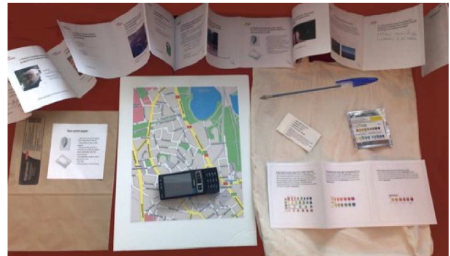
Figure 3. Kitbags contained 7 items that needed to be managed: sunlight photographs, map, phone, water testing kits, voucher for internet use, clue booklet and pen.

Each team was handed a kit that contained seven objects in all (see Figure 3). By design, these objects required some coordination between team members to manage well. The large physical maps, expanding clue booklets, manipulating the phone over the map, writing in the clue book, the bag, meant that the participants needed to organise themselves into some kind of system of use. There were no ready-made solutions, in-situ creative problem-solving was required, and solutions varied according to the immediate environment—for example, a tree, a team mate or a near-by bench might be used as a steadying, leaning or resting prop.