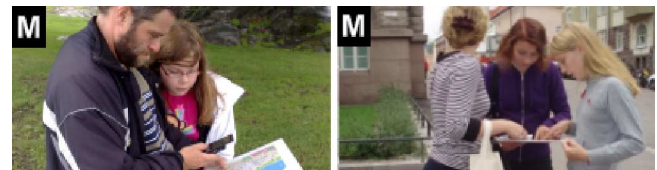
Figure 4. Most teams used MapLens (M) for both identifying the target and selecting the route. An exception is right, an M team using the paper map having identified the target.

Comparing M to D exposes several ways in which they both resource and constrain embodied interaction. By embodied interaction we refer here to the use of hands and body to position oneself, and the technology, in the context of other people and the environment.