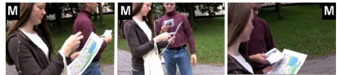
Figure 10. The physical map as a common ground, established by showing with MapLens (M) and pointing with finger.

We observed teams negotiating together in all parts of the trial. The discussions did not only concern the task at hand and what the team should do next (and by which route) but also how to best use the technology, see Figure 9 (centre). M users in many instances gathered together around the physical map to use M. The group members who did not have the phone gave instructions to the one holding M on where to look. Needing to hold the map stable restricted movement (Figure 9 centre), unlike for D where often one person was the 'navigator' of the group searching things from the mobile, while others observed the environment and led the way (Figure 9 right). Bodily configuration around D use was separate and individual. The smaller screen and lower visibility meant less sharing occurred and division of roles took place earlier in the game.