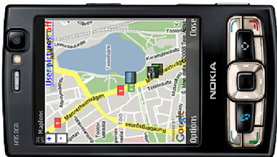
Figure 2. DigiMap version, Google Map with icons. Used by the control group in the trial.

Our implemented method [34] was optimised to operate on the N95 phone. The system operates at between 5 and 12 FPS, depending on the speed of motion of the camera allowing for interactive use. For this study a template image was used that allows operation from about 15 to 40 cm distance between the printed map and the camera. Tilt between the map and the camera is tolerated up to 30 degrees, while in plane rotation is handled over the full range of rotations. We used the same Google-map screen-capture image for both the virtual and the physical maps, as well as for our DigiMap version. The physical map was printed onto an A3 size page, allowing white space around all sides of the map.