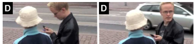
Figure 8. Turning to gaze the environment was more natural with DigiMap (D) that does not block view and constrain upper body movement as much as MapLens (M).

D players occasionally turned the device—typically 90 degrees—for aligning the map with the environment. This may have been because the smaller size of D makes it easier to turn, or that D players struggled with reading the small screen size map.